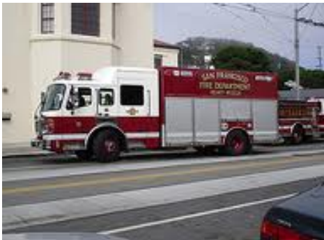
Heavy Rescue Squad